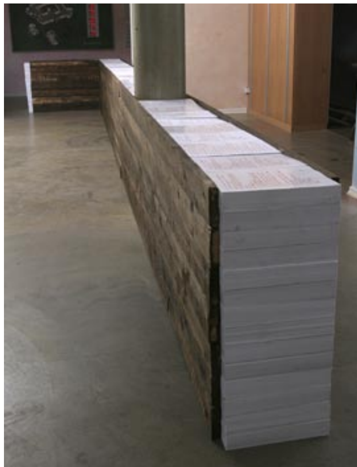
Letter of Love