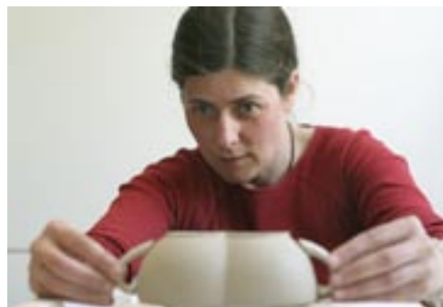
comunio | 2006 | porcelain, wood, 18 x 28 x 9 cm