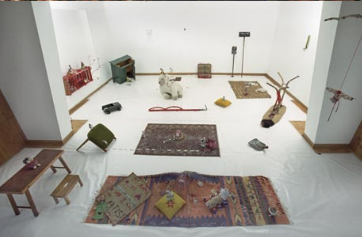
On the Edge