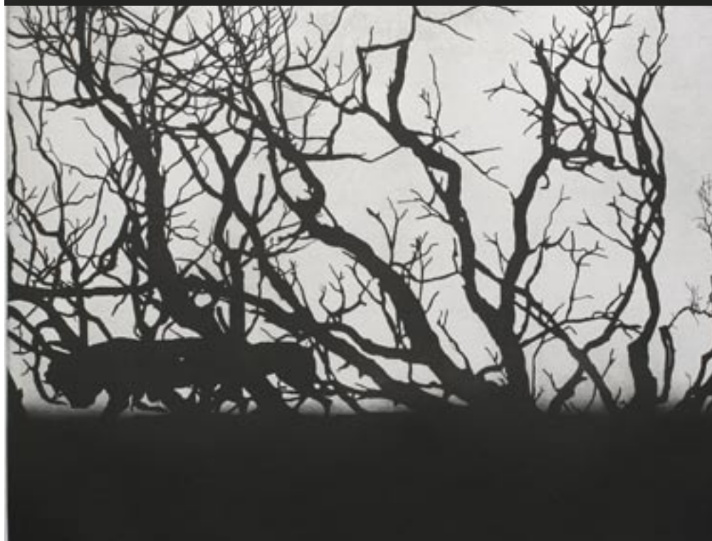
Nightmare at Grand Royal Hotel