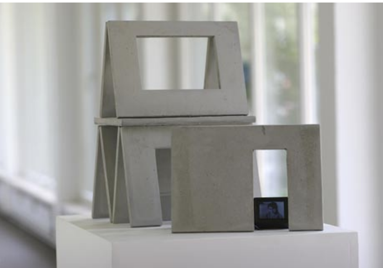
Palästinensisches Museum Berlin/Palestinian Museum Berlin