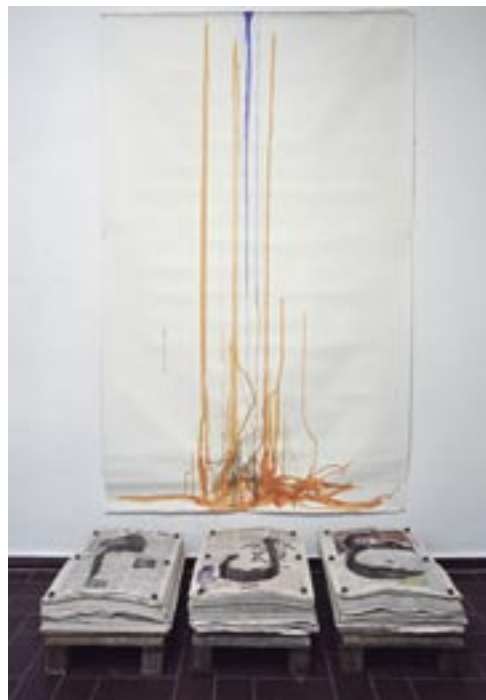
Looking for a flag

Palestine | 2006 | sunflower-seeds and acrylic paint on wood Looking for a flag | 2006 | newspaper, nails, mirror (three-part) Three Cows | 2004 | acrylic paint on wood, 147 x 166 cm