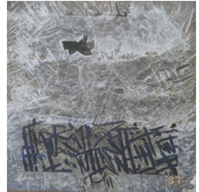
peace and the islamic greeting and basmala