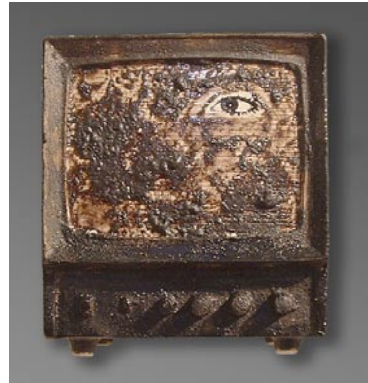
Du'ara Channel (longing to the future)

Lung disease | 2006 | glazed and printed ready-made ceramic dishes