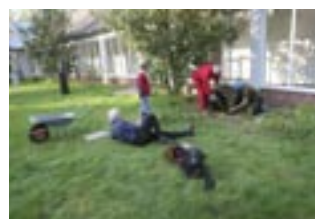
my family | 2006 | painting on photographic paper