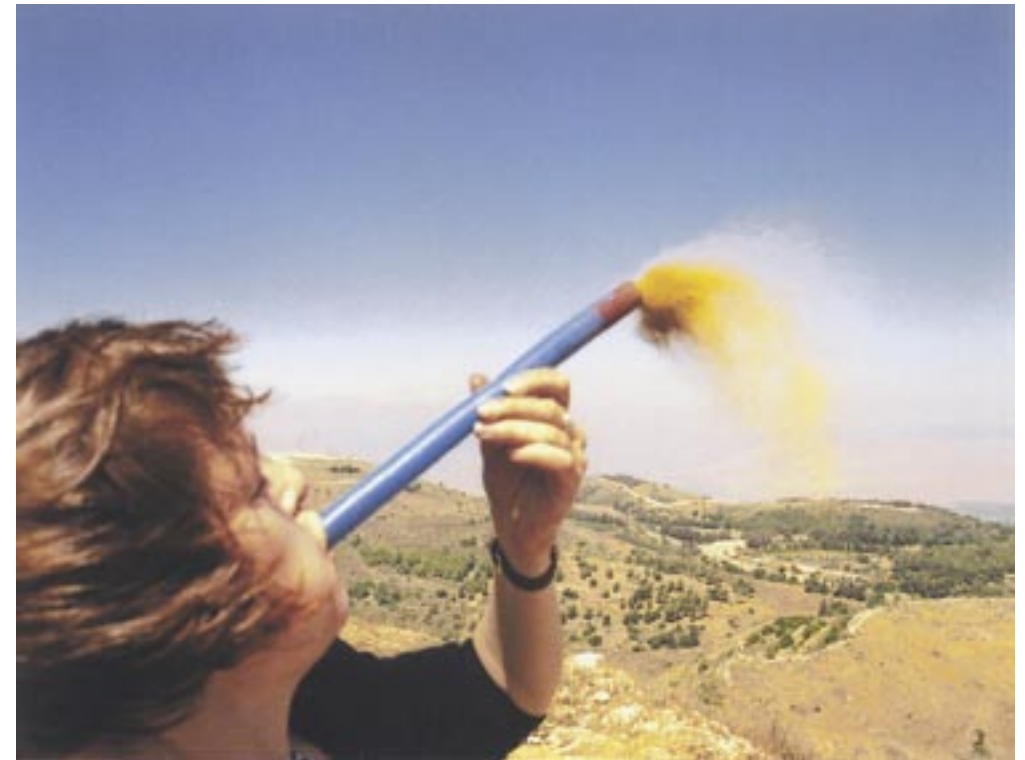
performance with yellow pigment at the closed Lebanese-Israeli border

Phantoms | 2006 | video-installation DVD, (Edition 10)